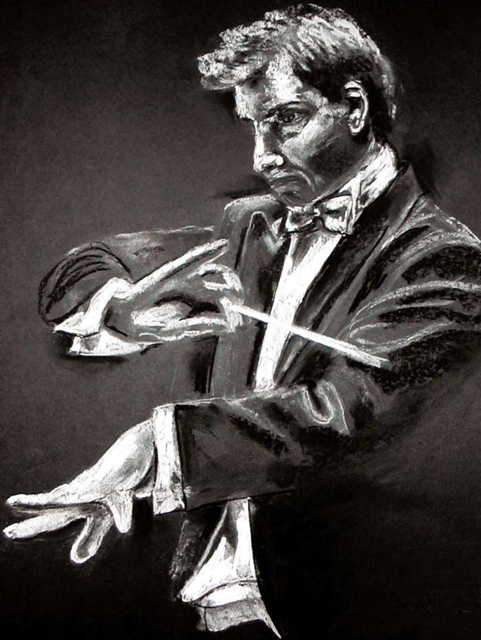
An example of prisoner artwork which has been exhibited throughout Northern Ireland alongside other prisoner artwork.